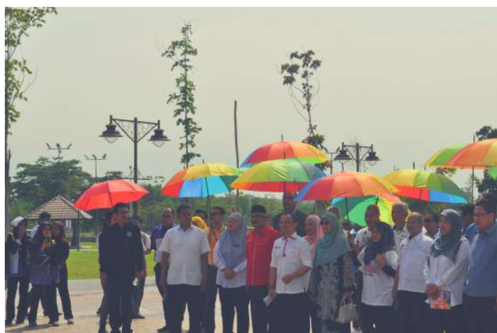
The arrival of YB Dr. Maszlee Malik