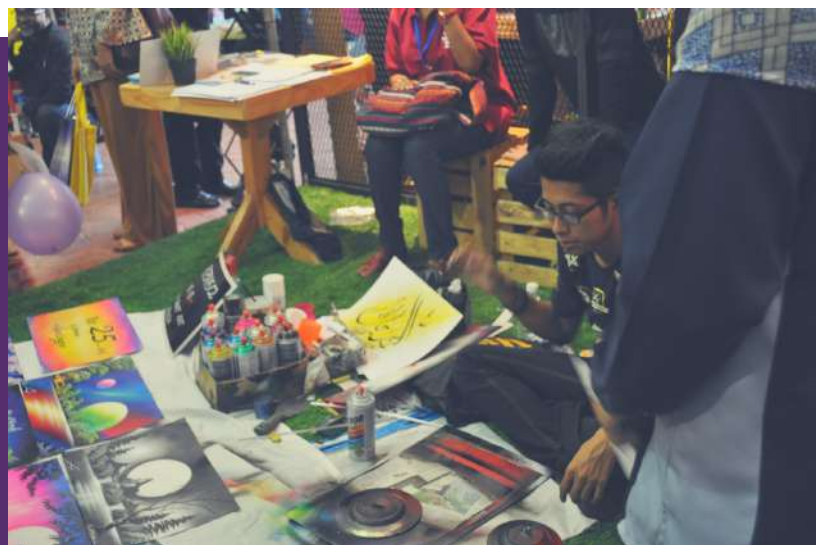
One of the participants of the exhibition, Spray Paint Art Malaysia is demonstrating their art.

Besides cultural performances, there are also outdoor activities and exhibitions from selected government and educational bodies to pave the way and opportunities for the public and young people to explore UNESCO's vision and aspirations and the key role played by the agency in the quest towards sustainability, prosperity and eternal peace.