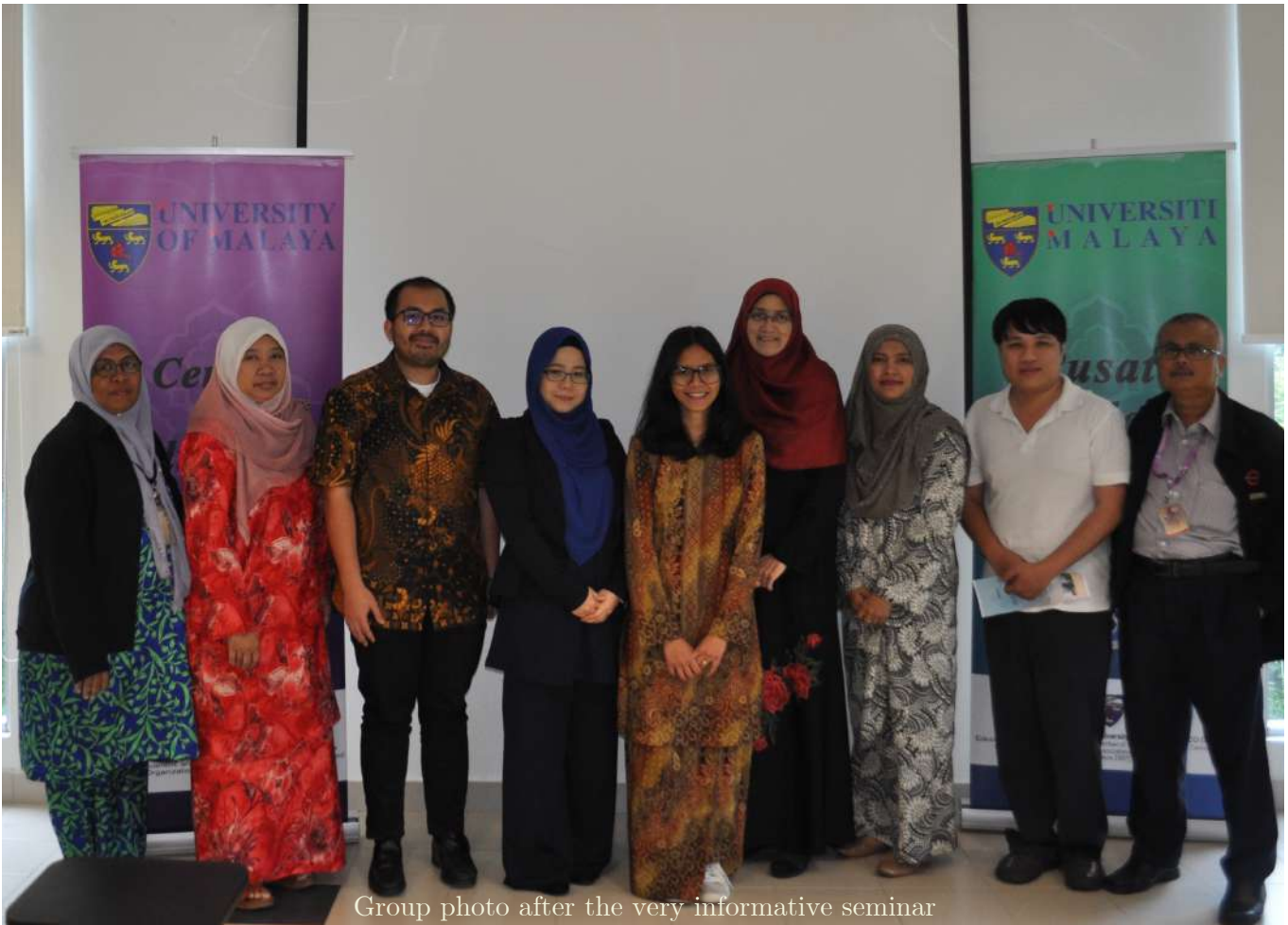
Group photo after the very informative seminar