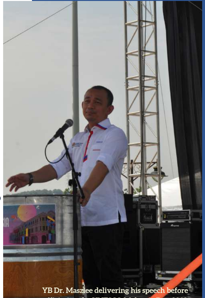
YB Dr. Maszlee delivering his speech before officiating the UNESCO Malaysia Day 2018

The arrival of the YB Minister was welcomed by the Seng Siyok Serayok Group from the Kinta district featuring the performance of the Sewang Dance. The unique dance was accompanied by the unique and fun tune of Centong. YB Minister in his speech hopes to continue to organise the celebration of UNESCO-Malaysia Day in future. It is to attract and nurture greater interest and participation from the people not only from the government agencies and non-government organizations but also the young people in the future. He also hopes that such event organised by the UNESCO will continue to be intensified. He also expressed that the UNESCO clubs will be set up at all public universities, vocational colleges, polytechnics and secondary schools nationwide, beginning next year. He said the function of the clubs would be to bring about sustainable development goals. Furthermore, it is to widen the knowledge of UNESCO's direction among young people in particular.