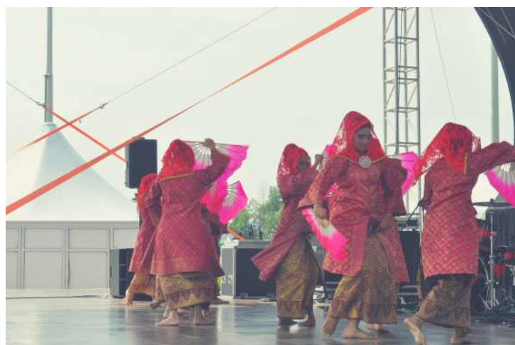
The traditional dance performance for the opening ceremony