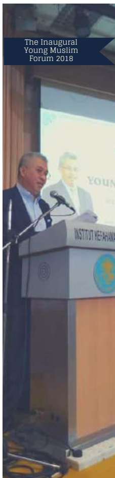
The Inaugural Young Muslim Forum 2018