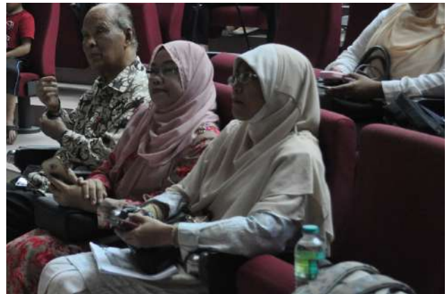
The panelists for the forum