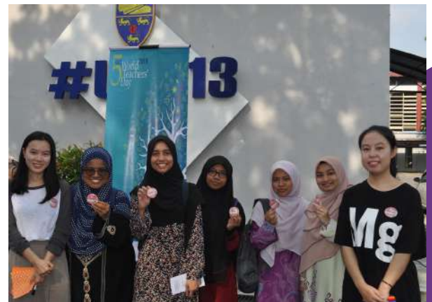
The students took photos after writing their expressing notes for their teachers Look at those happy faces!

The event went so well and ended with so many happy faces as we are welcoming the UM community to the venue with a few live and busking performances by our UM students.