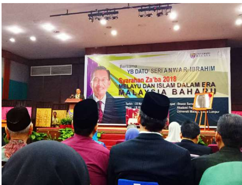
The audience paying attention to the informative and inspiring lecture