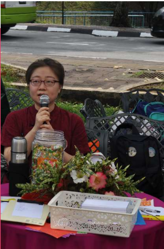
One of the students performing for the event

In appreciating the roles of teachers and educators, 'World Teachers' Day' is commemorated by the United Nations (UN), also is one of the UNESCO International Days to be celebrated worldwide to acknowledge the work of teachers and their contributions to the society especially in providing quality education from preschool up to university levels. The 'World Teachers' Day' is observed every 5th of October and under certain circumstances, it is celebrated closer to the proposed date. The initiative to celebrate this day will enable people from all walks of life and of all ages to appreciate, participate and contribute towards better education through various approaches and means. Hence, we would like to voice our solidarity by celebrating this event at the national level.