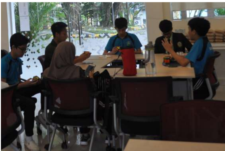
The participants gave their best to win the competition

Two activities were also conducted during this event which is the Rubik's Cube Challenge and Short Video Sketch Competition. Both competitions were open to the public and mostly participated by the invited schools students. The winners were given cash prizes at the end of the event. Overall, the celebration was successfully held and we hope that the theme can be appreciated by all the the participants.