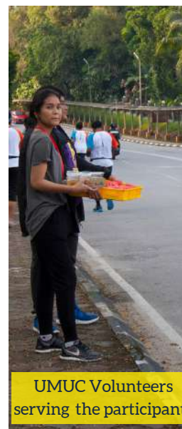
UMUC Volunteers serving the participants