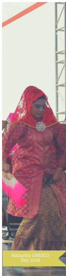
Malaysia UNESCO Day 2018