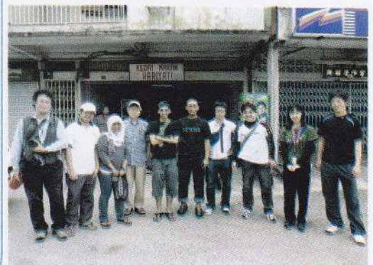
Participants of the Study Tour