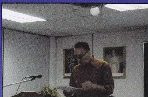
During the lecture