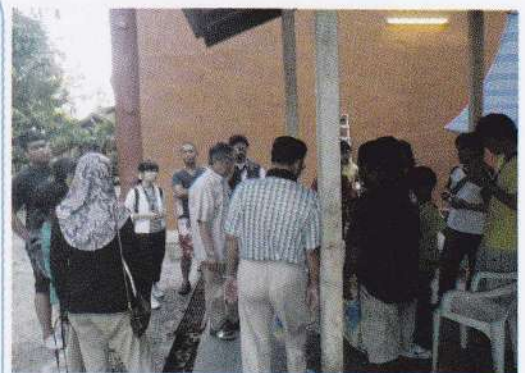
At the Aboriginal Settlement